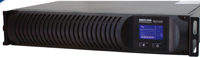
PRO1500RT - 1500VA/1050W Line Interactive UPS