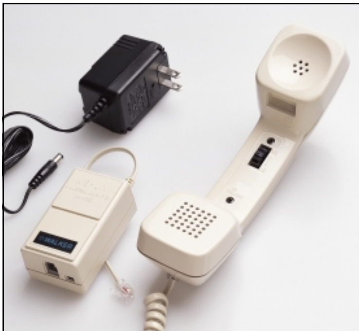
Handset shown: W6-UNI-K

The W6B is only available in K-style. The W6-UNI G-style is available by special order only. Both units are available with noise canceling. Hearing aid compatible.